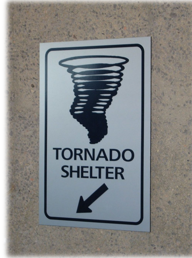
"Tornado Shelter" by what is marked with CC BY-NC-SA 2.0 .