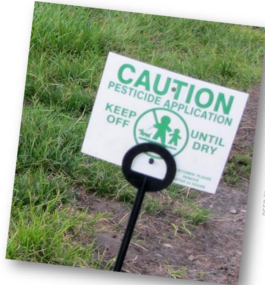
PSEP file photo