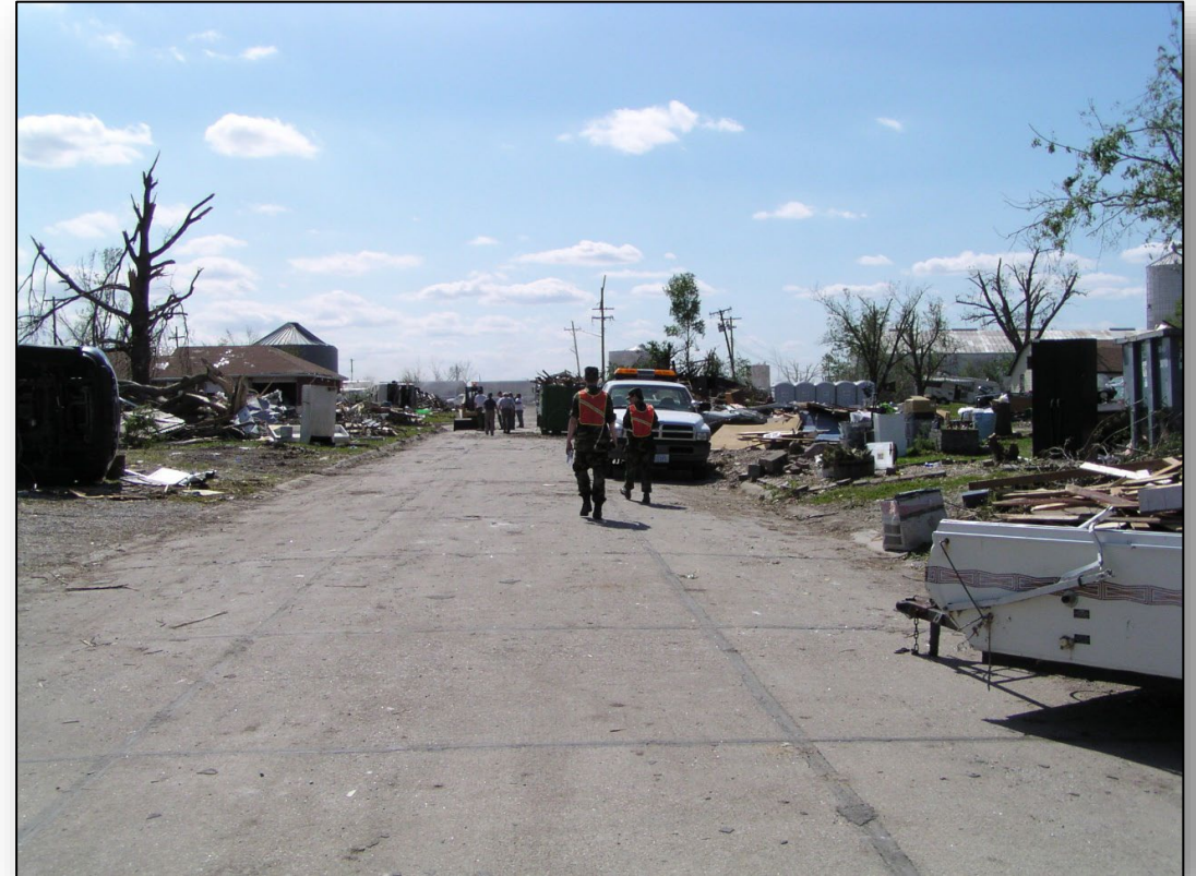
Hallam, Nebraska damaged by a tornado