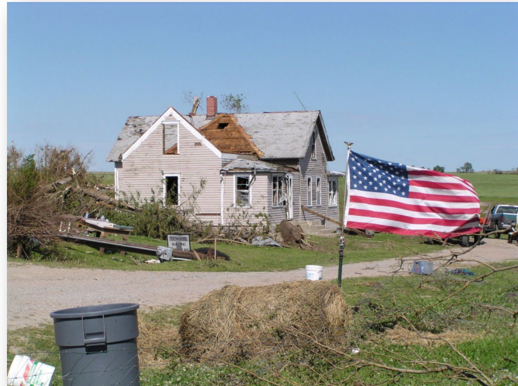
Farm near Wilber, Nebraska damaged by a tornado