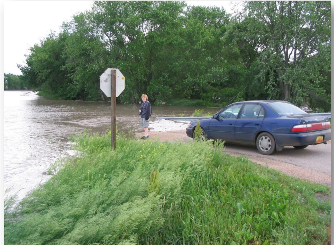
Flooding near Pickrell, NE. V. Jedlicka