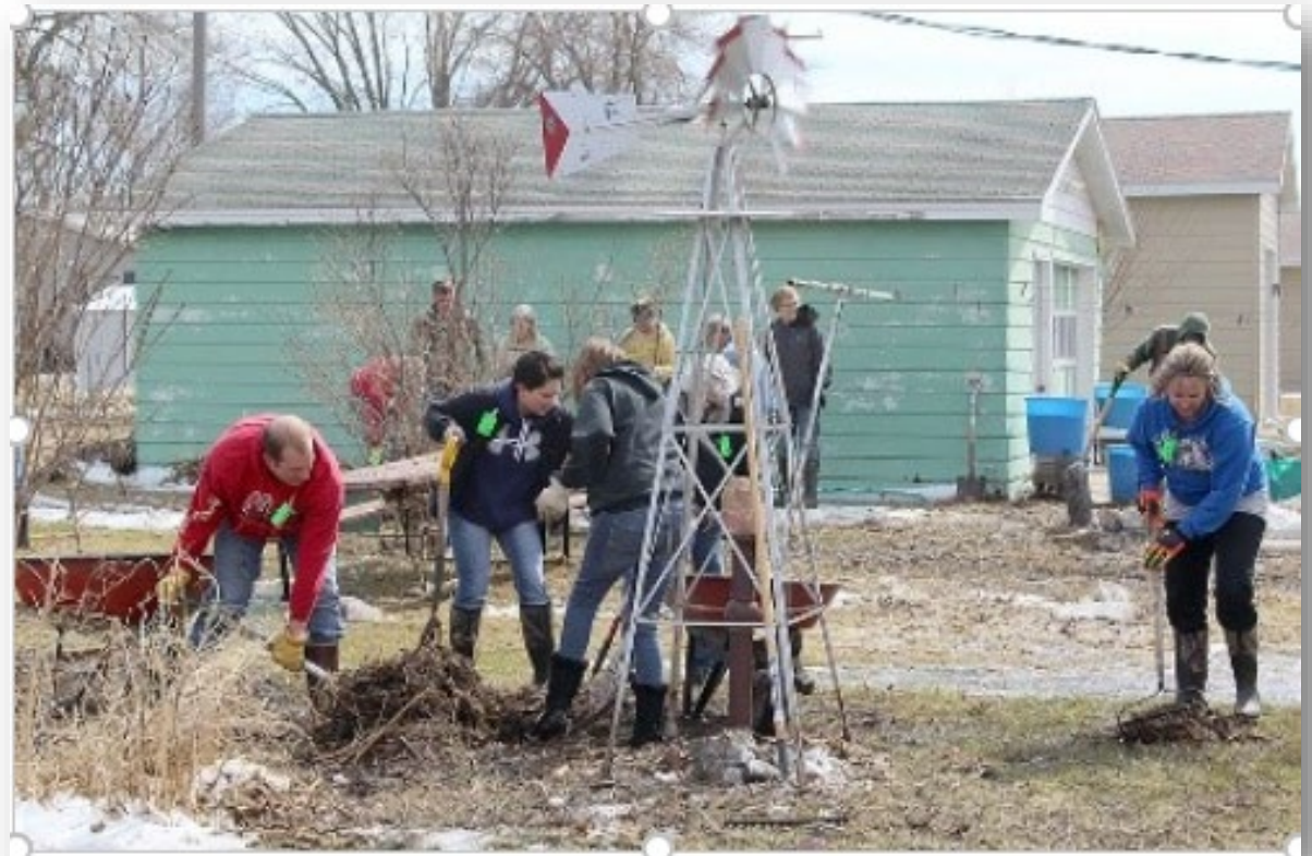
Volunteers cleaning up after a flood (2019)