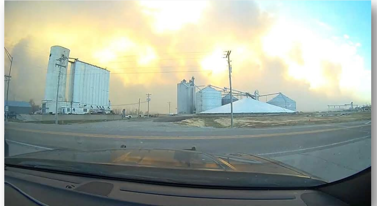
Road 739 Fire near Arapahoe, Nebraska. Nebraska State Patrol, April 2022